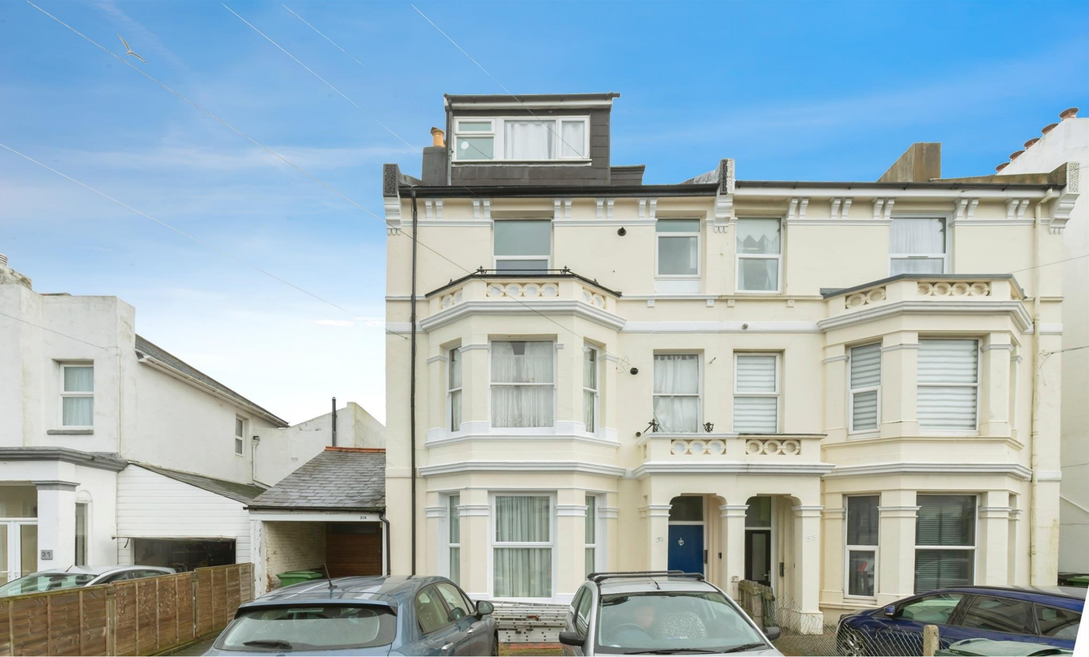
Flat D Bohemia Road, St. Leonards-On-Sea TN37 6RA