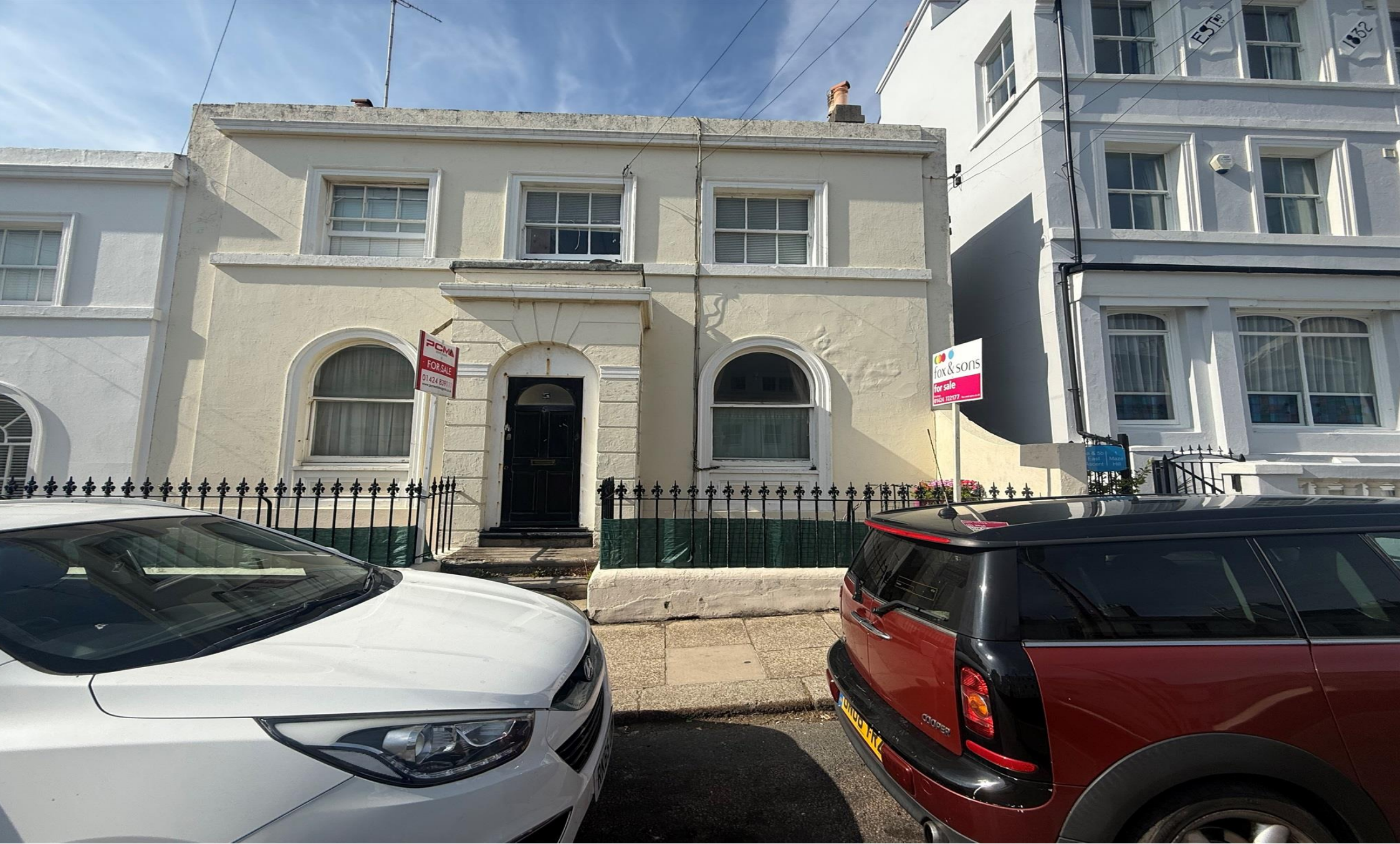
East Ascent, St. Leonards-On-Sea TN38 0DS