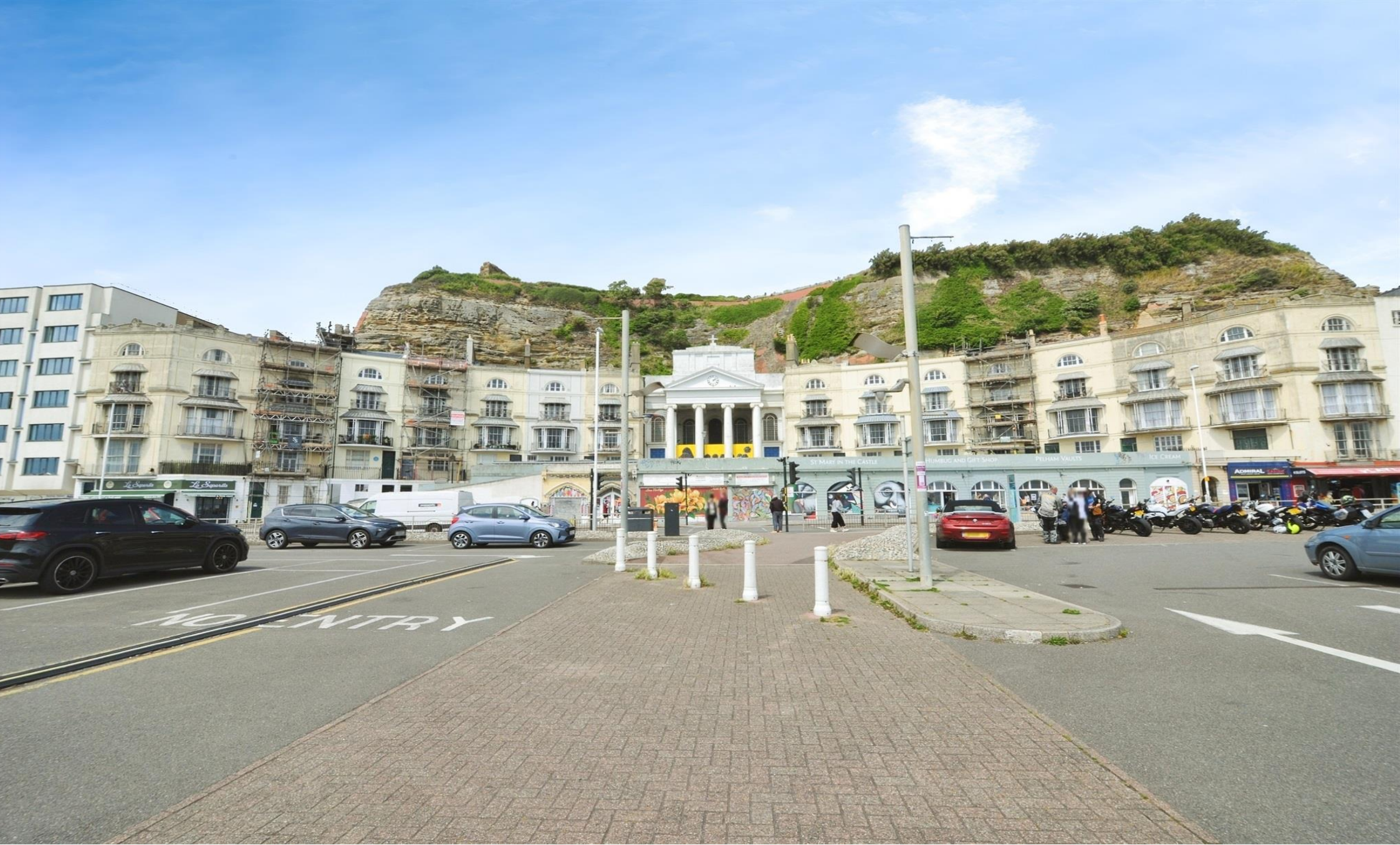
Pelham Crescent, Hastings TN34 3AF