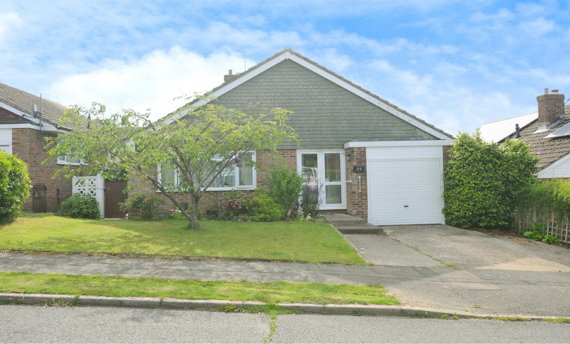
Austen Way, Hastings TN35 4JH