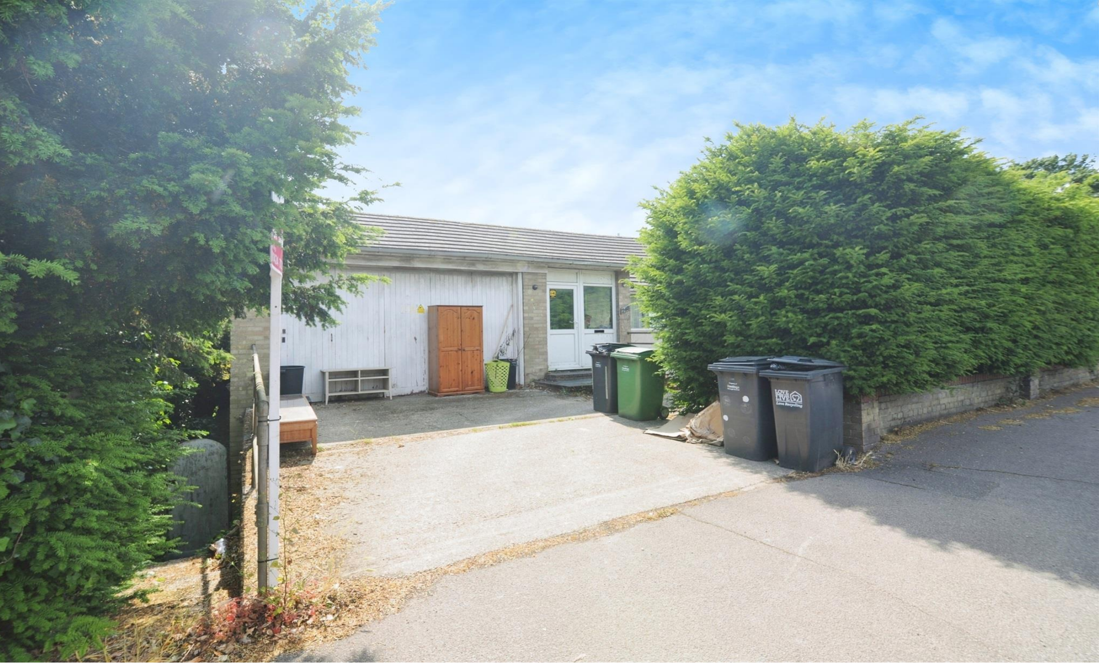
Sedlescombe Road North, St. Leonards-On-Sea TN37 7JL