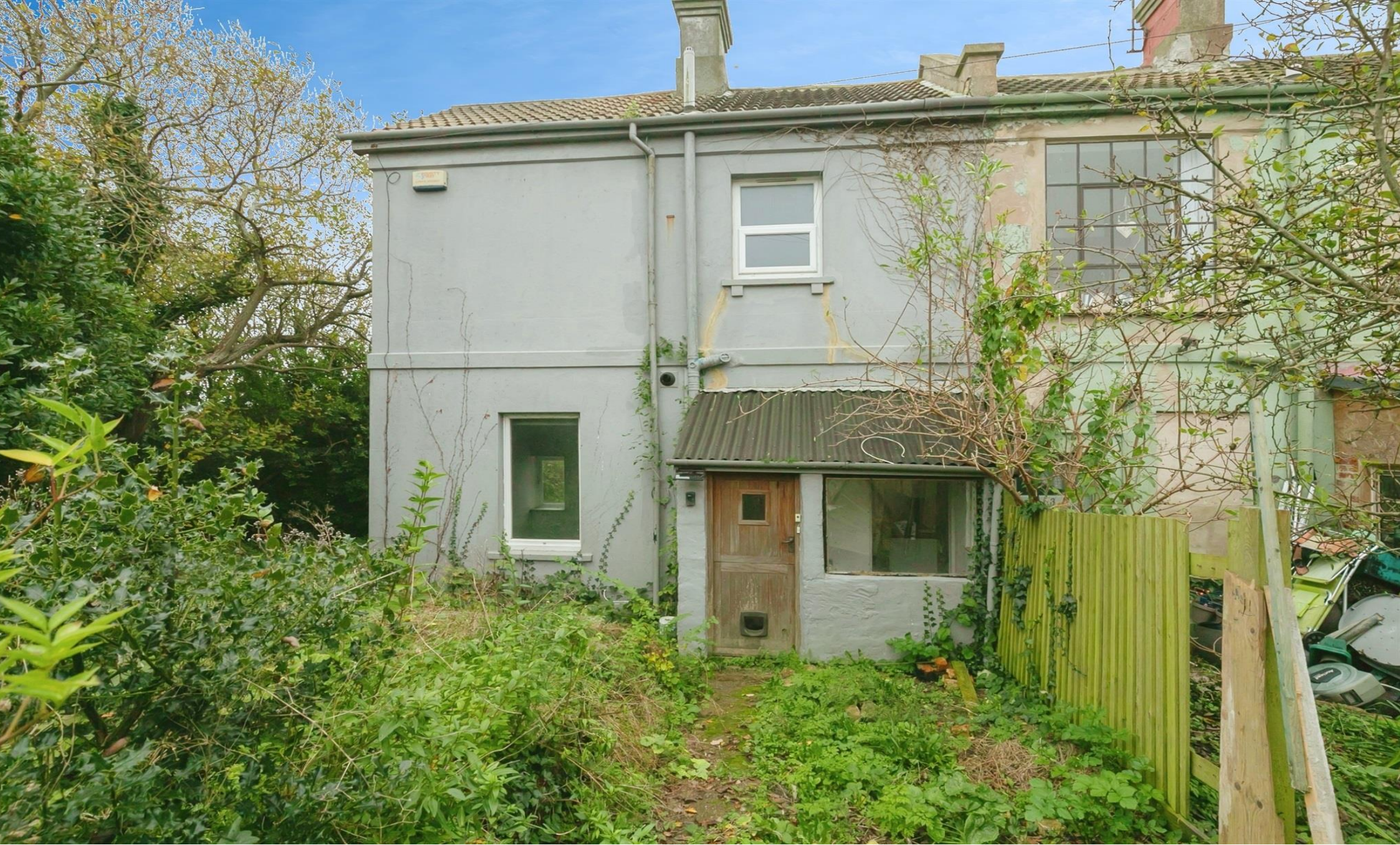
Railway Cottages, St. Leonards-On-Sea TN38 0AW