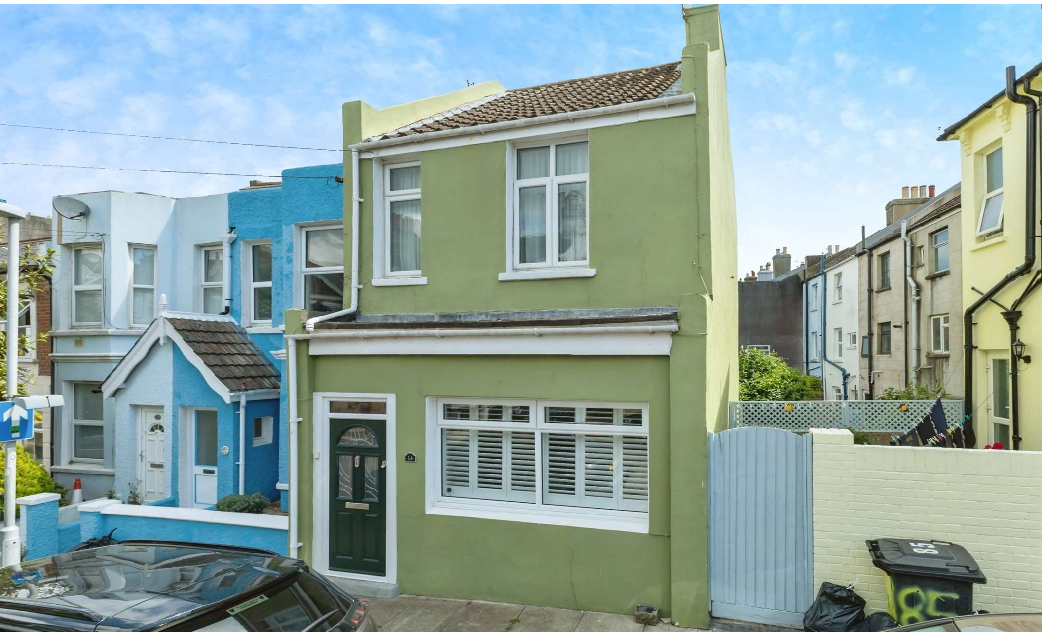
Calvert Road, Hastings TN34 3NG