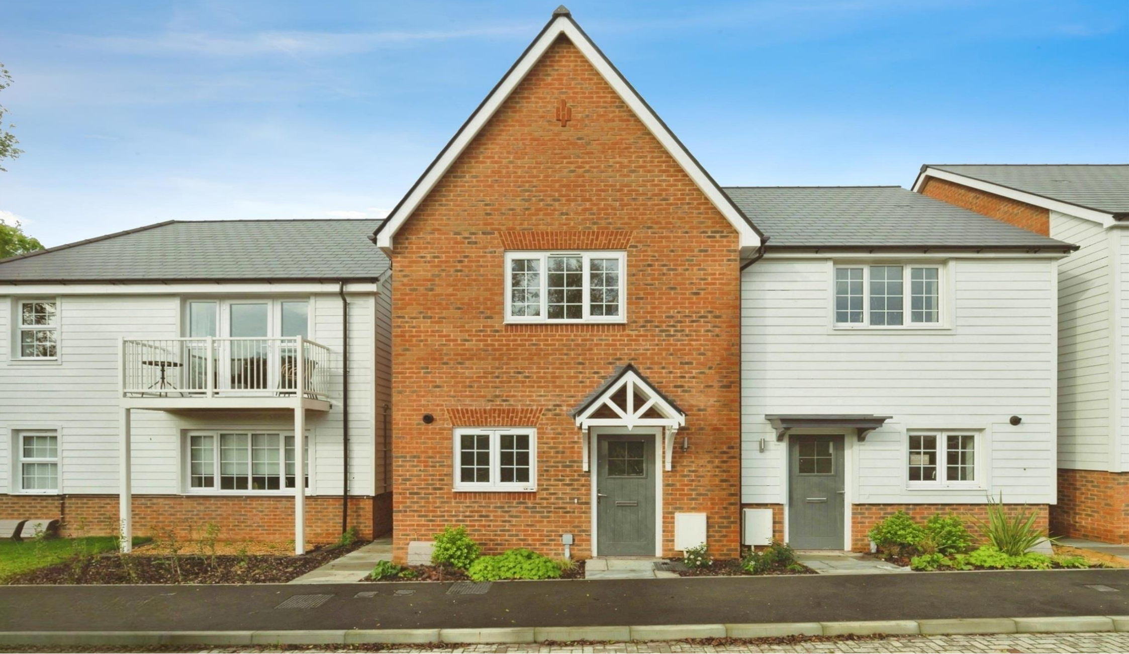
The Oak The Brook, Northiam Rye TN31 6QF