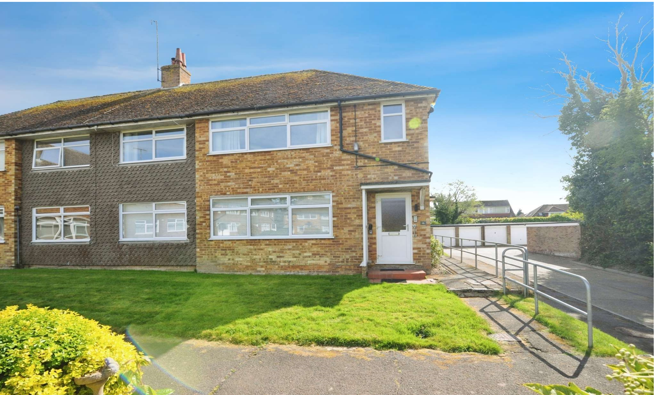
Hollington Court, St. Leonards-On-Sea TN38 0SF