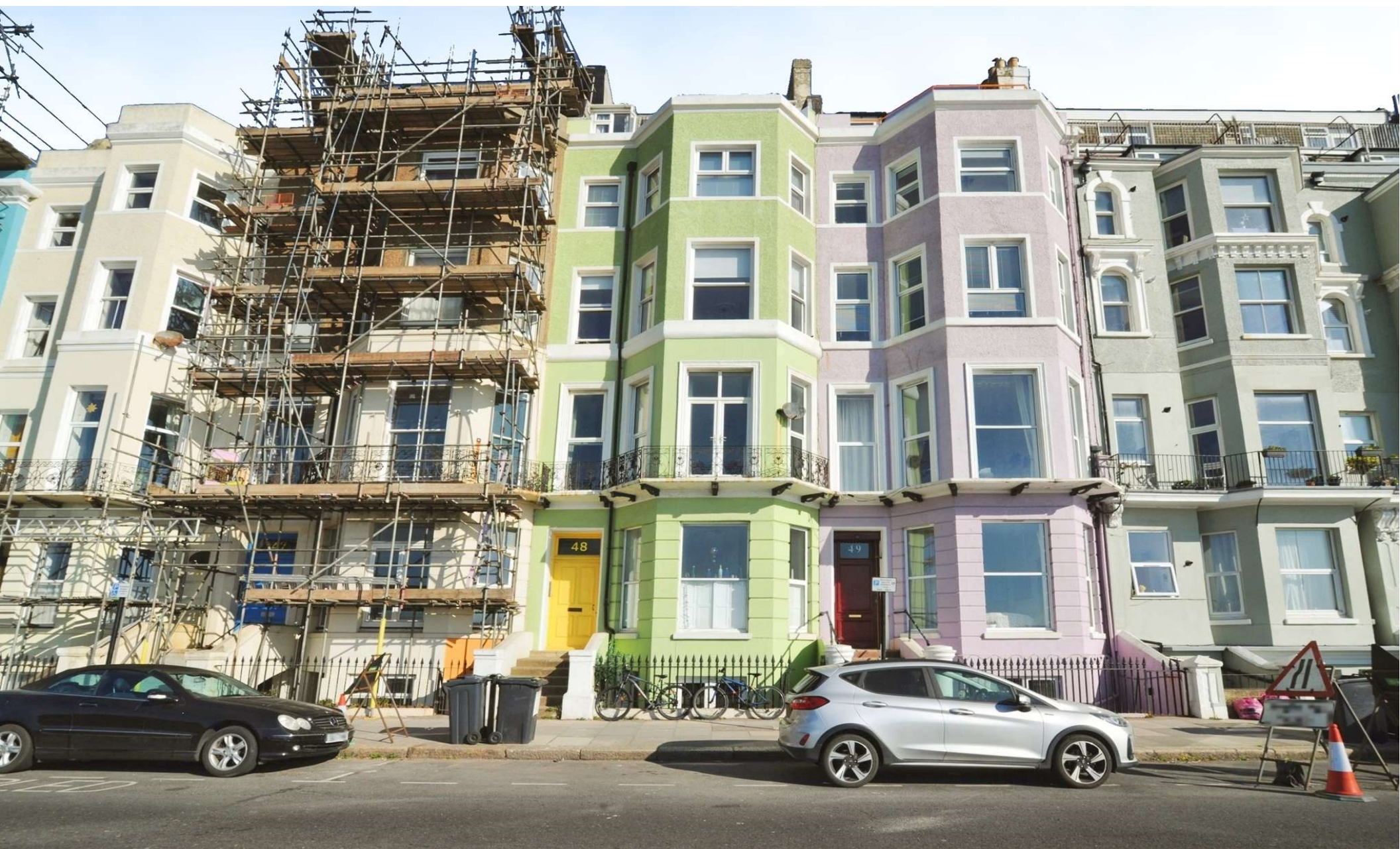
Eversfield Place, St. Leonards-On-Sea TN37 6DB