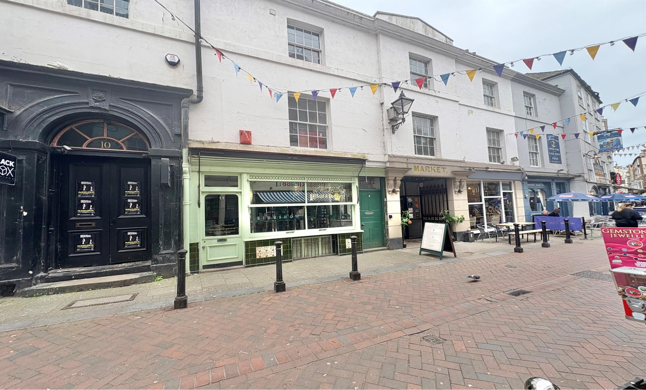
George Street, Hastings TN34 3EG