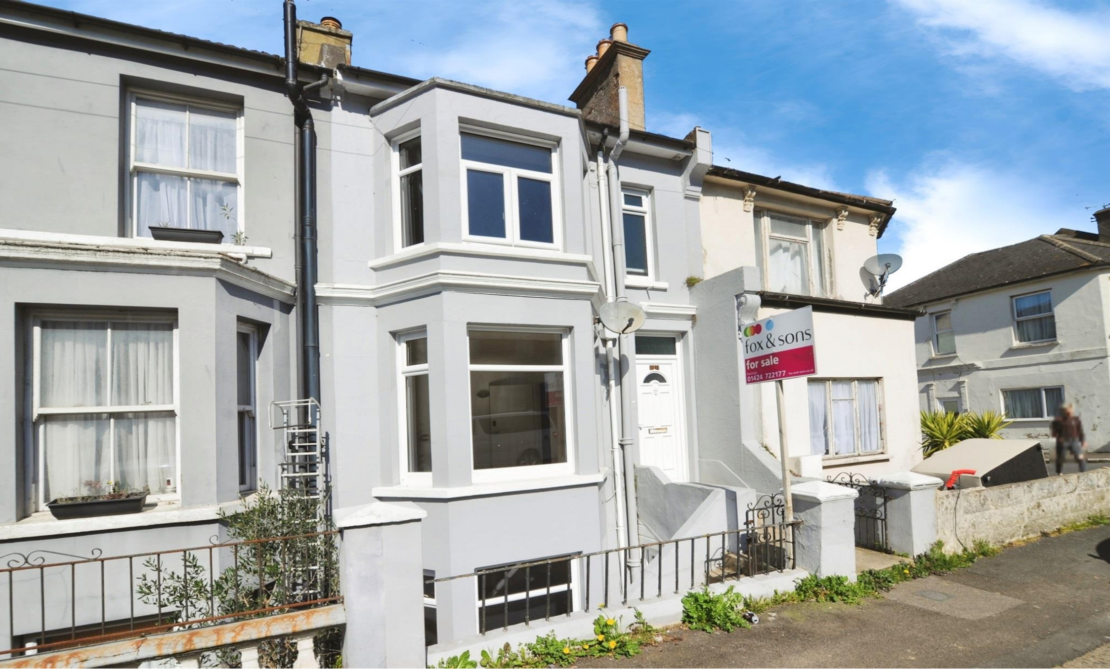
St. Georges Road, Hastings TN34 3NH