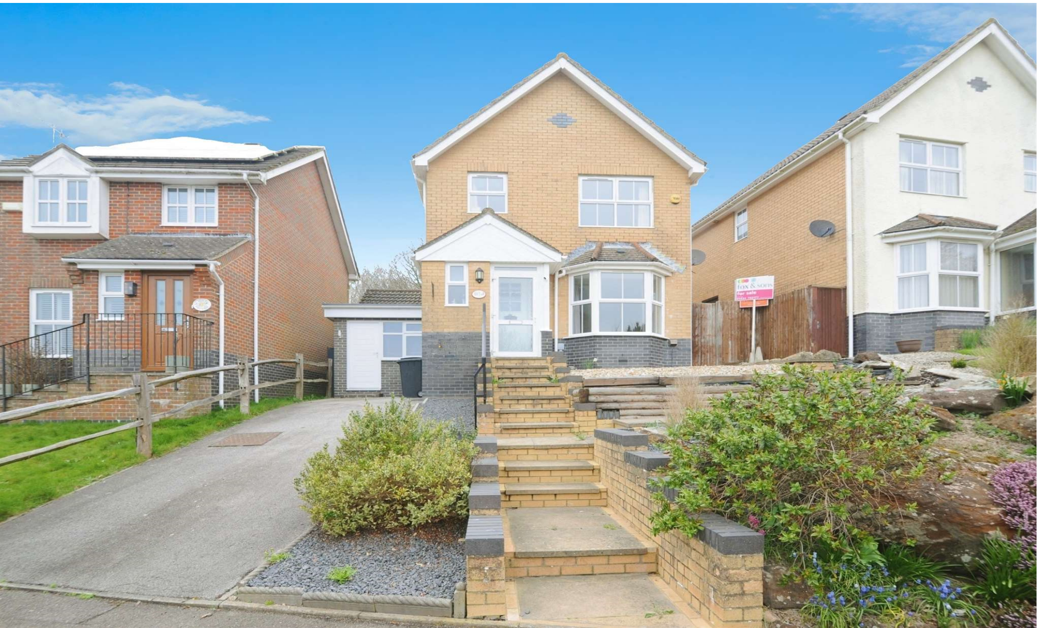
Highwater View, St. Leonards-On-Sea TN38 8EL