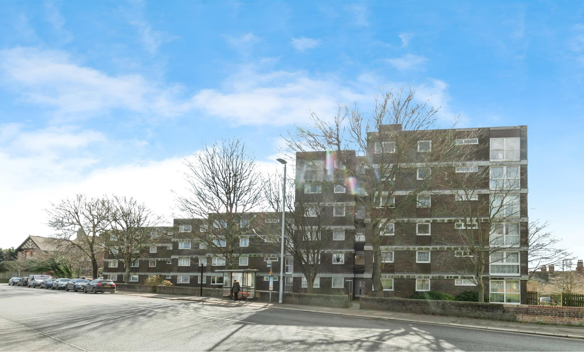
Bayeux Court Bohemia Road, St. Leonards-On-Sea TN37 6RZ