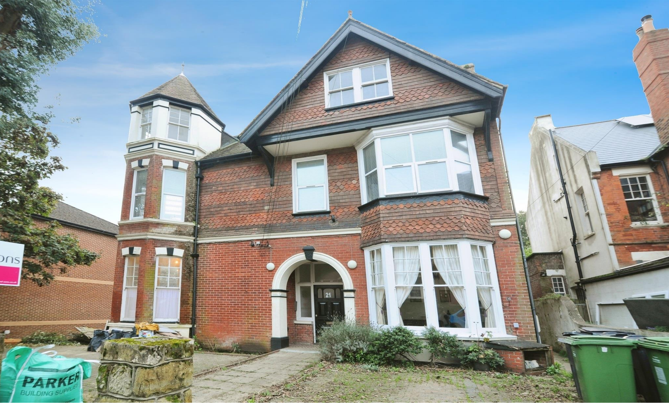
Woodland Vale Road, St. Leonards-On-Sea TN37 6JJ