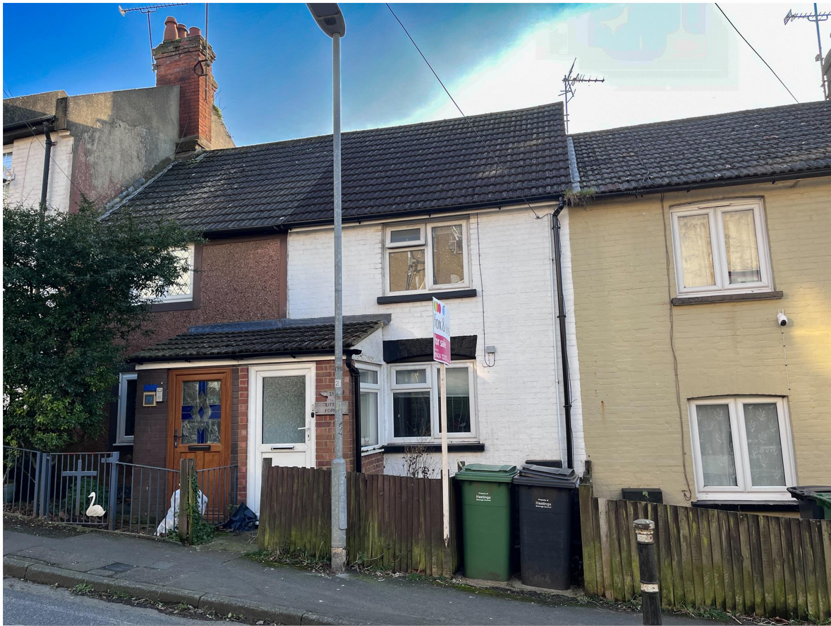
Hollington Old Lane, St. Leonards-On-Sea TN38 9DT