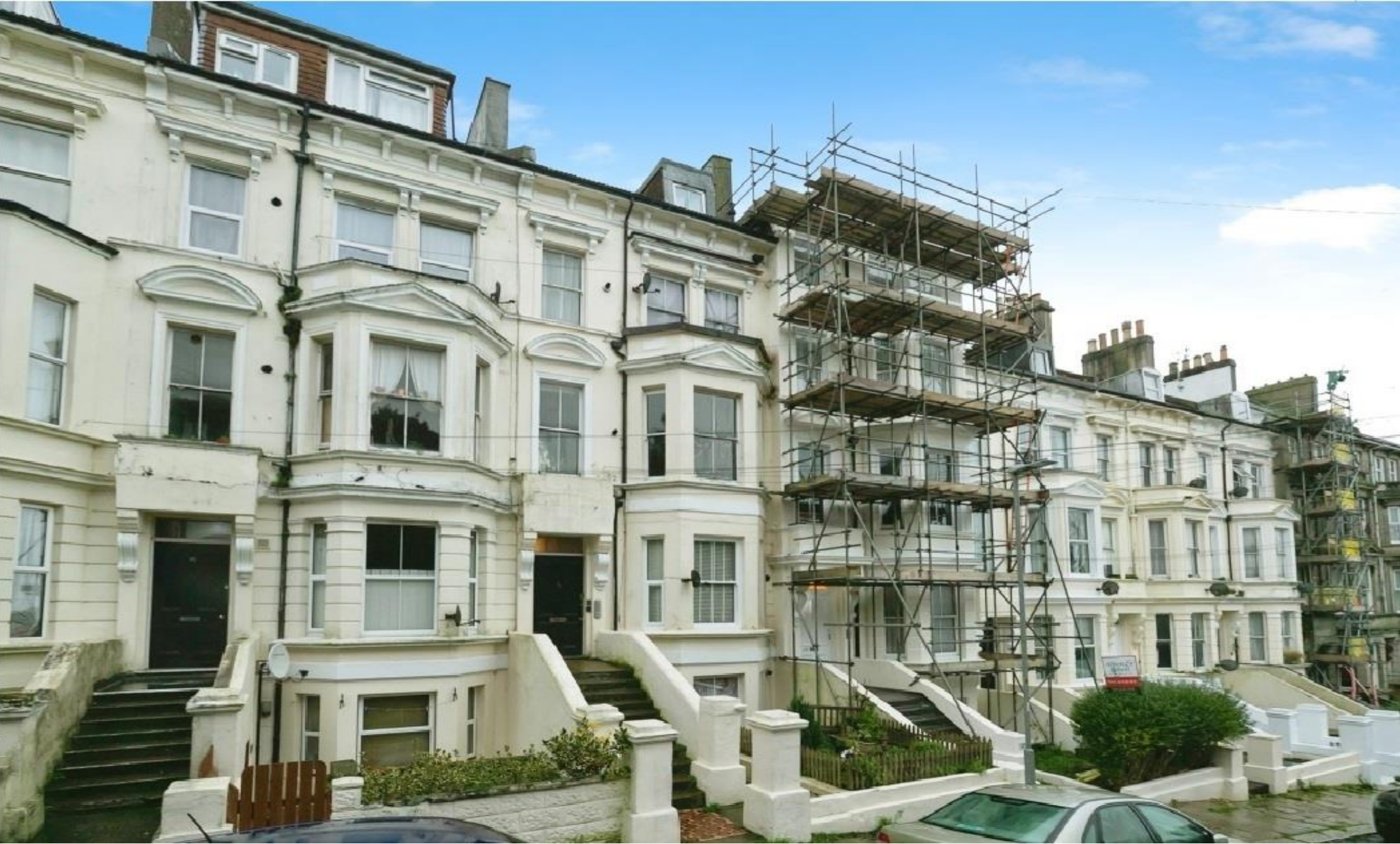
Kenilworth Road, St. Leonards-On-Sea TN38 0JL