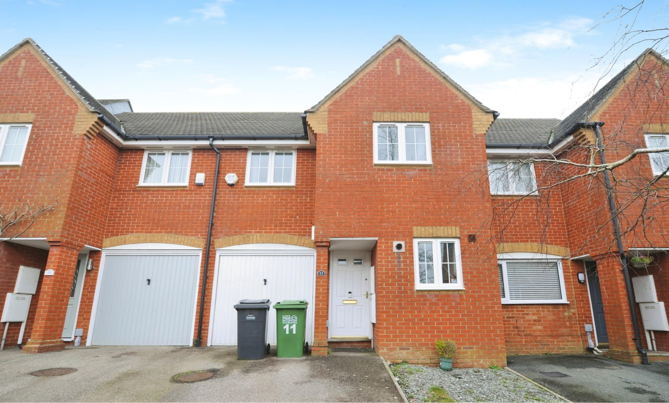
Carvel Court, St. Leonards-On-Sea TN38 8EX