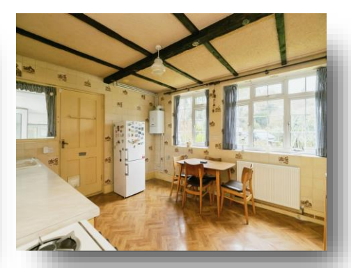
Eight Acre Ln Eight Acre Ln