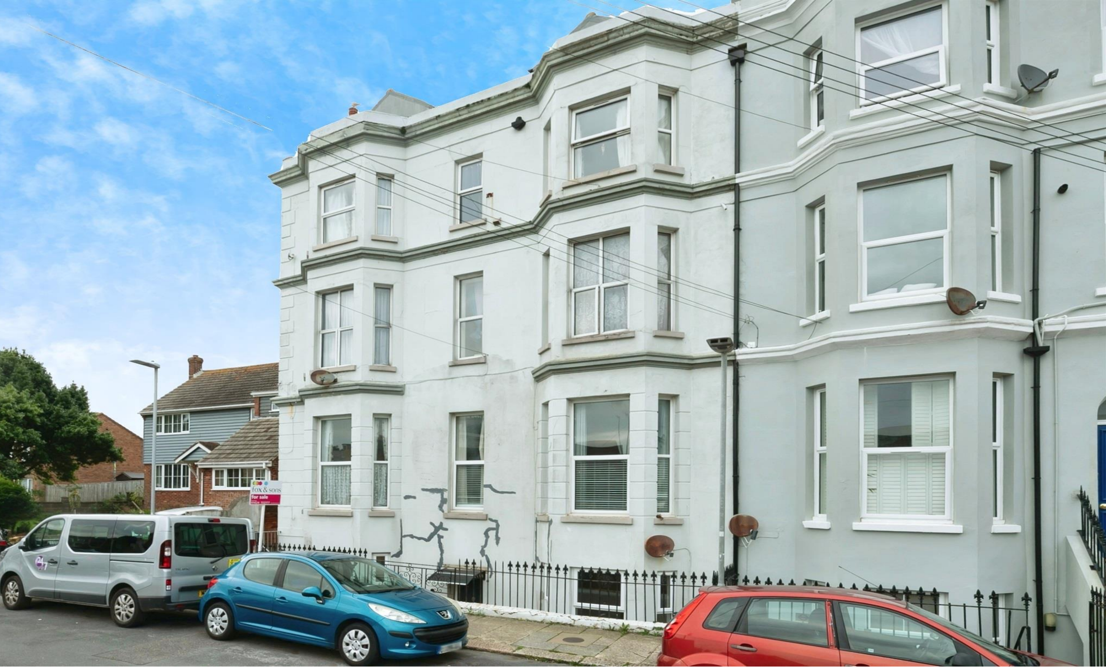
Blomfield Road, St. Leonards-On-Sea TN37 6HH