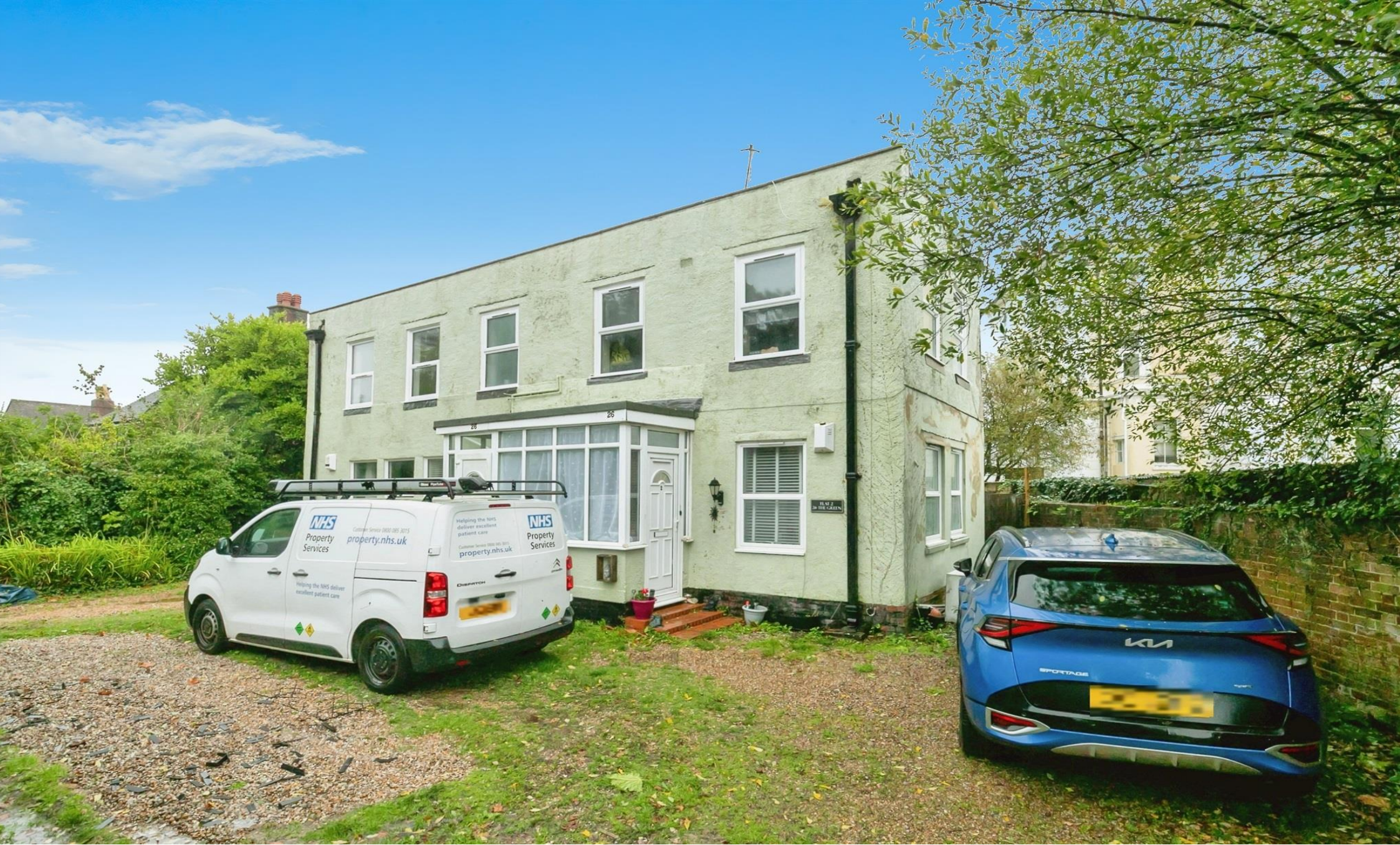
Flat 2 The Green, St. Leonards-On-Sea TN38 0SU