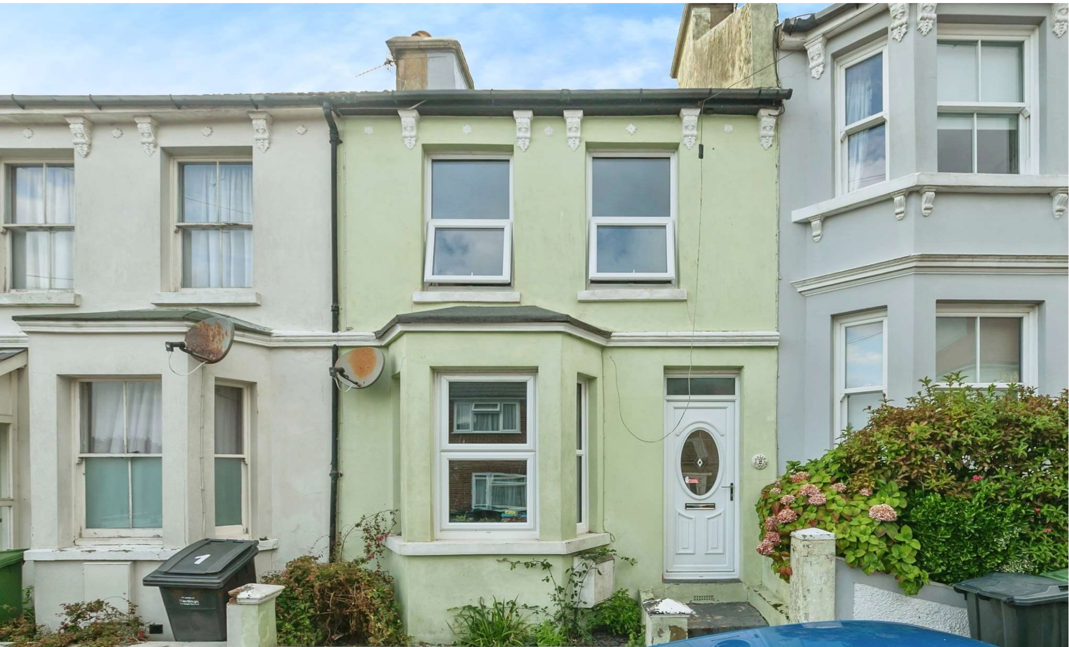
Grove Road, Hastings TN35 4JS