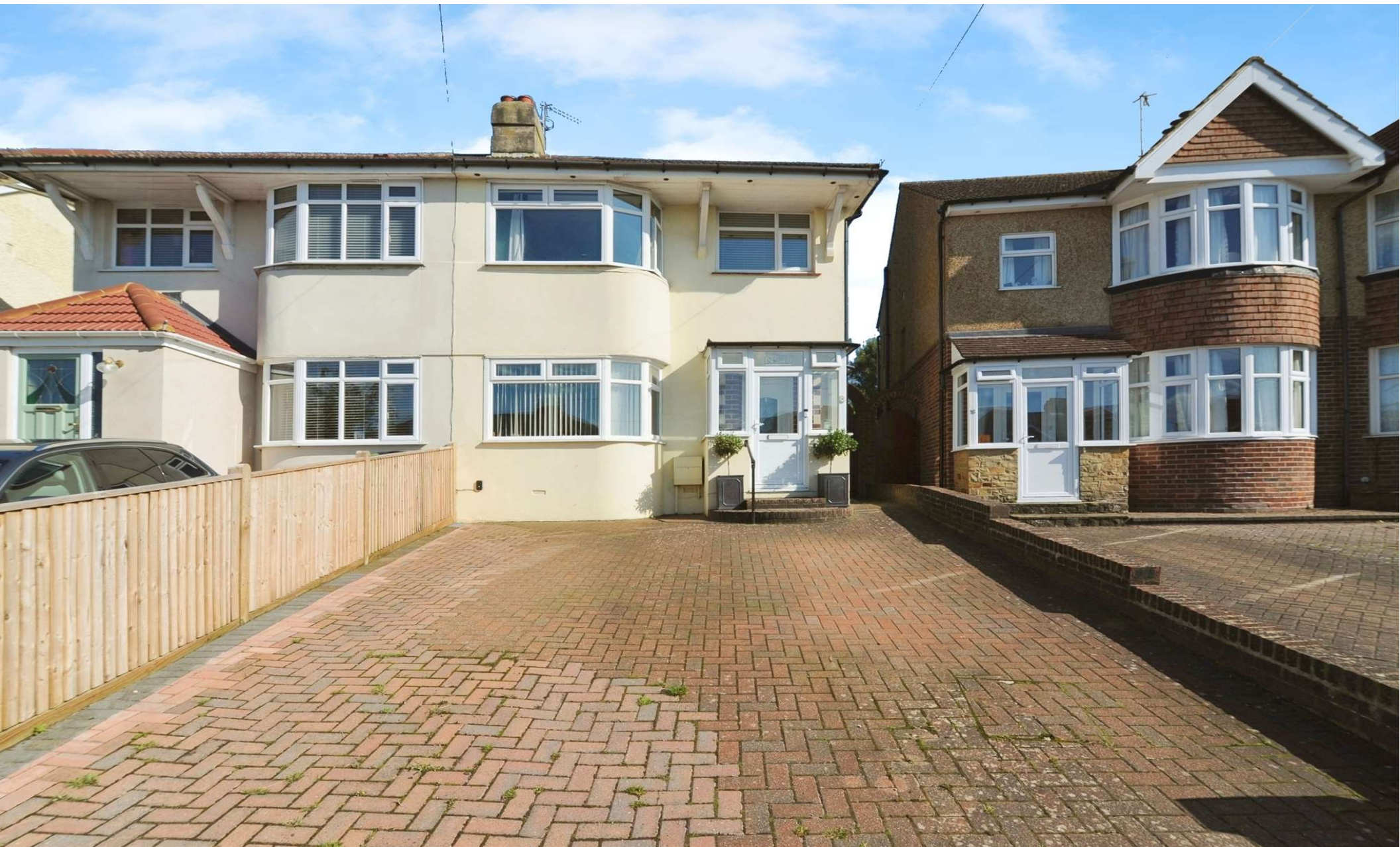
Mildenhall Drive, St. Leonards-On-Sea TN37 7EF