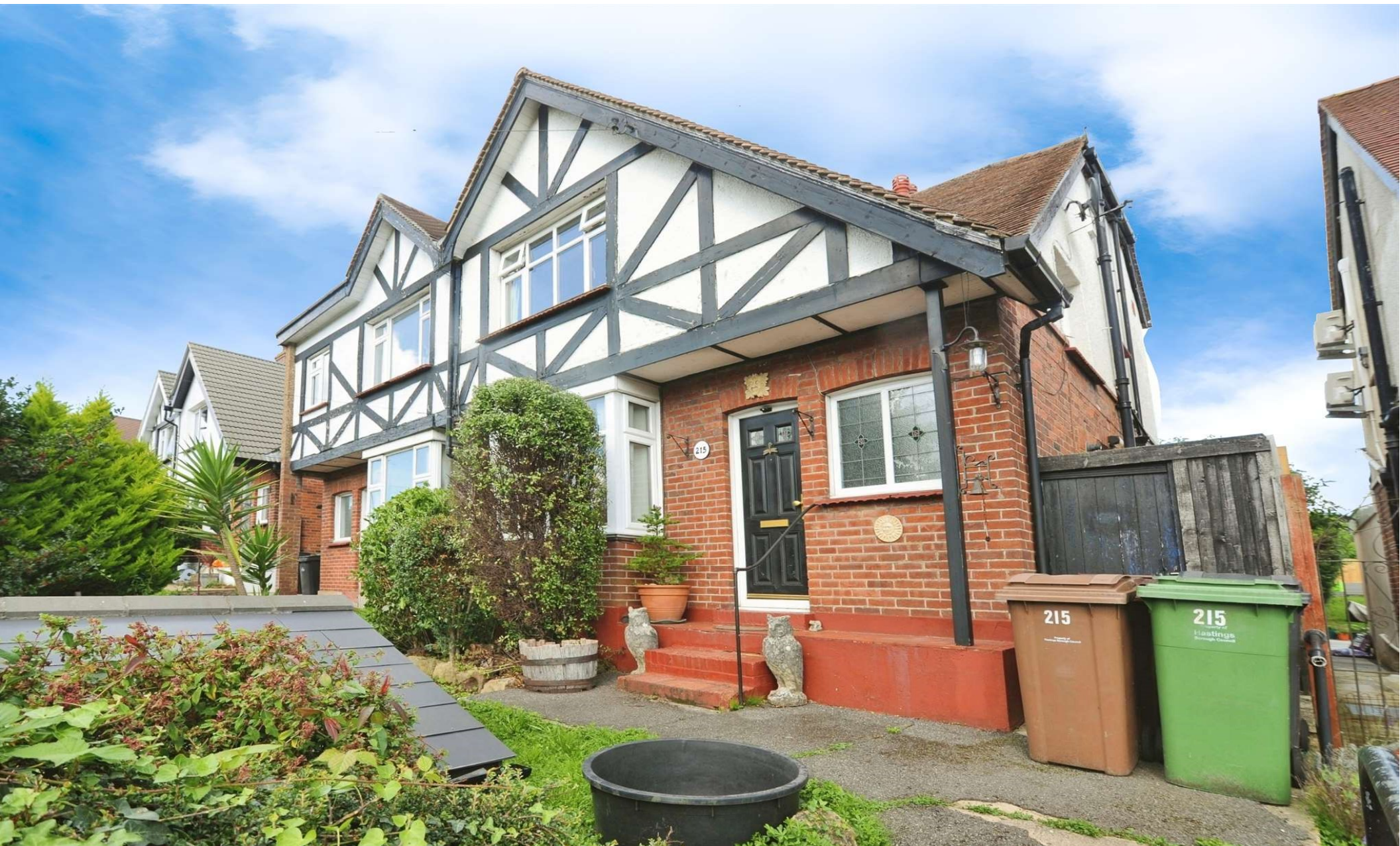
St. Helens Road, Hastings TN34 2NB