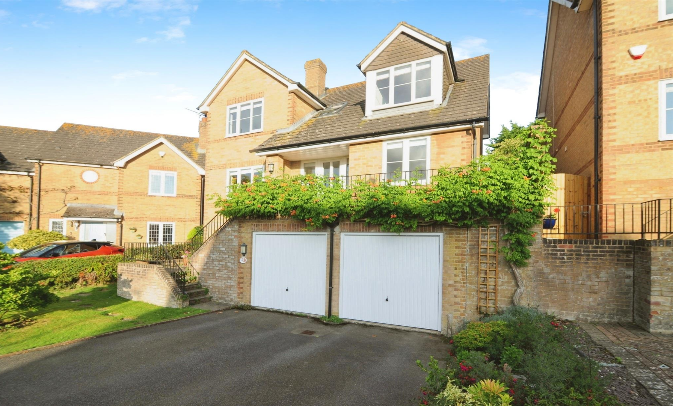
The Spaldings, St. Leonards-On-Sea TN38 9TP