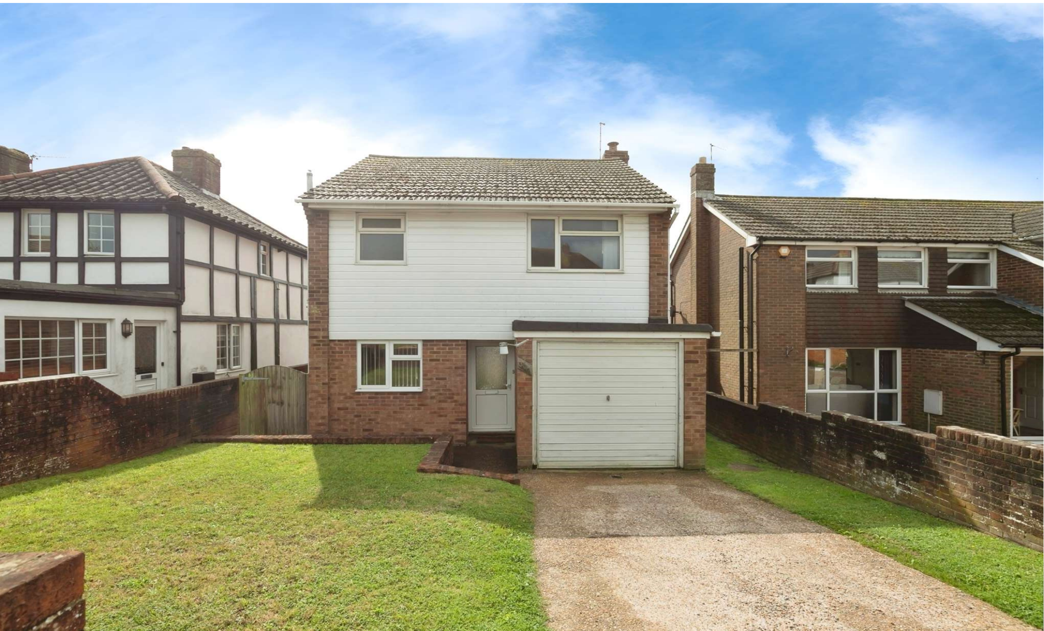
30a Rye Road, Hastings TN35 5DG