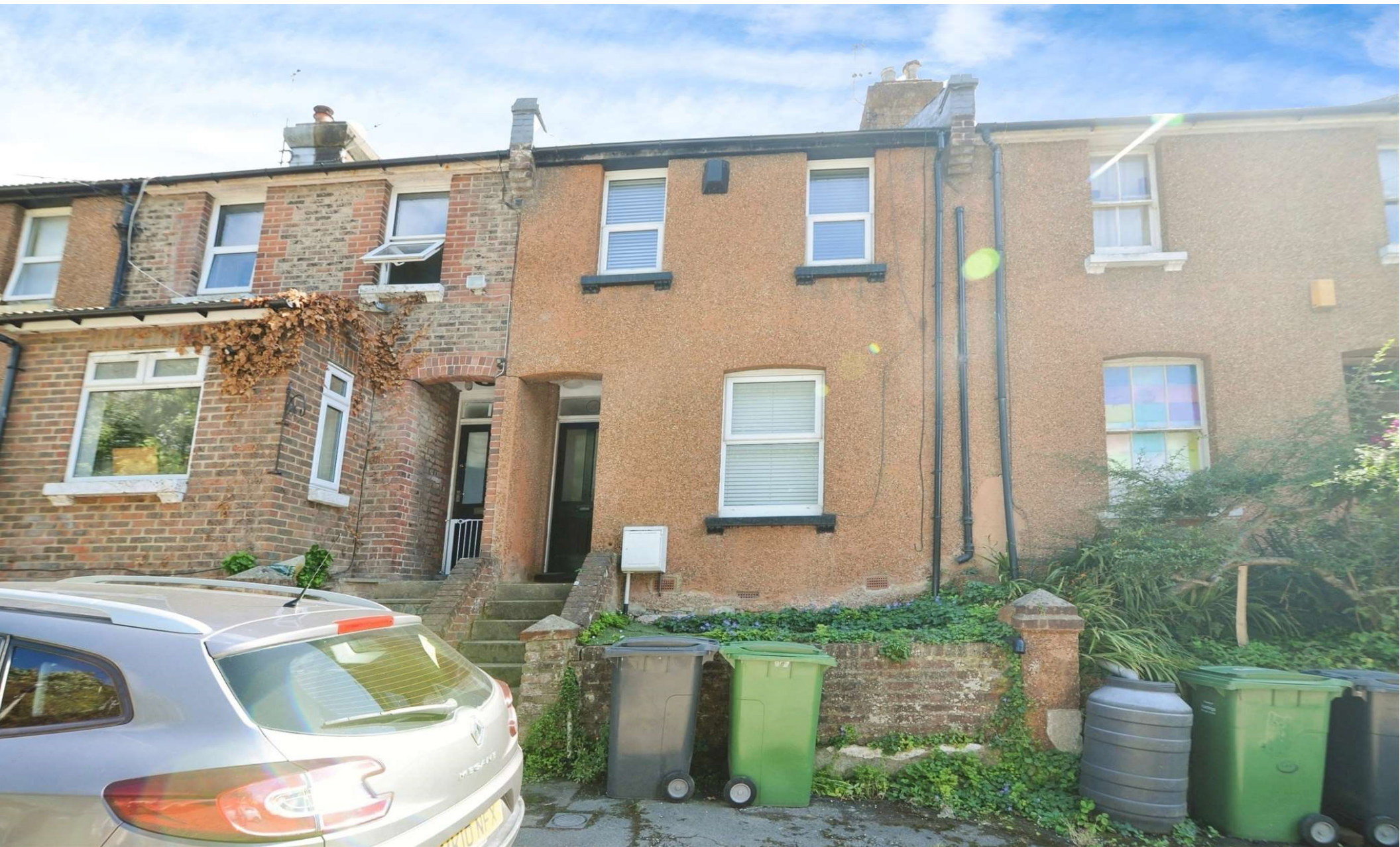
Hurrell Road, Hastings TN34 3PN