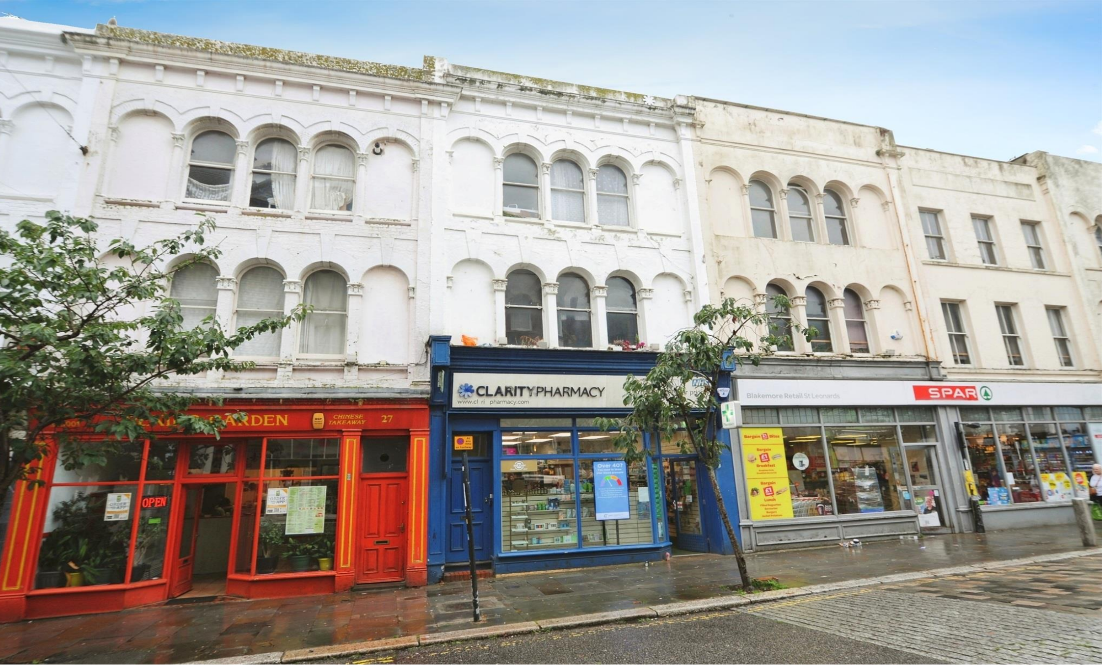
Kings Road, St. Leonards-On-Sea TN37 6DU