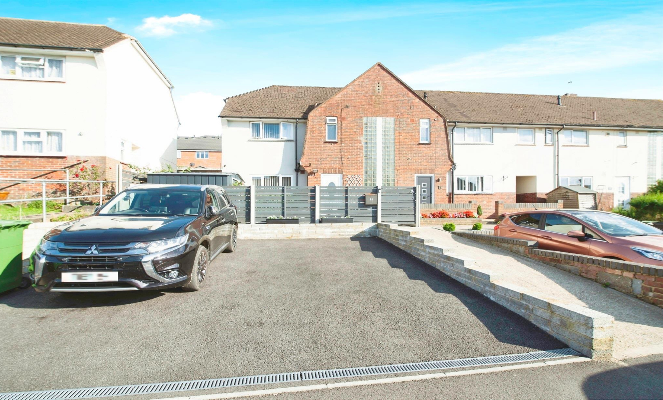
Mountbatten Close, Hastings TN35 4LE