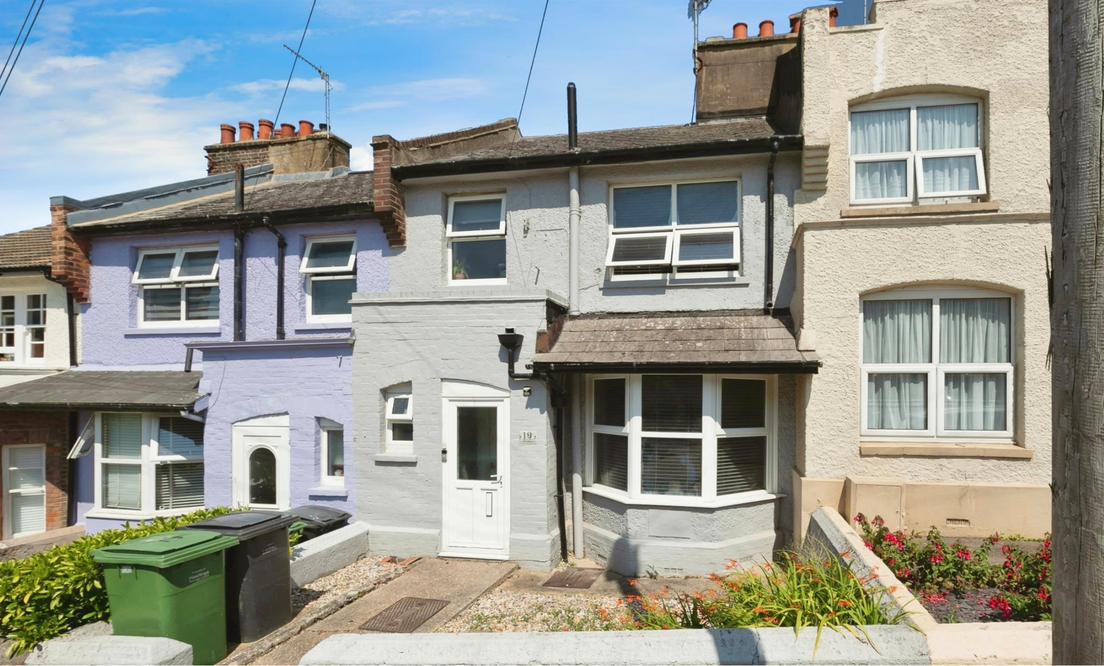
Adelaide Road, ST. LEONARDS-ON-SEA TN38 9DA