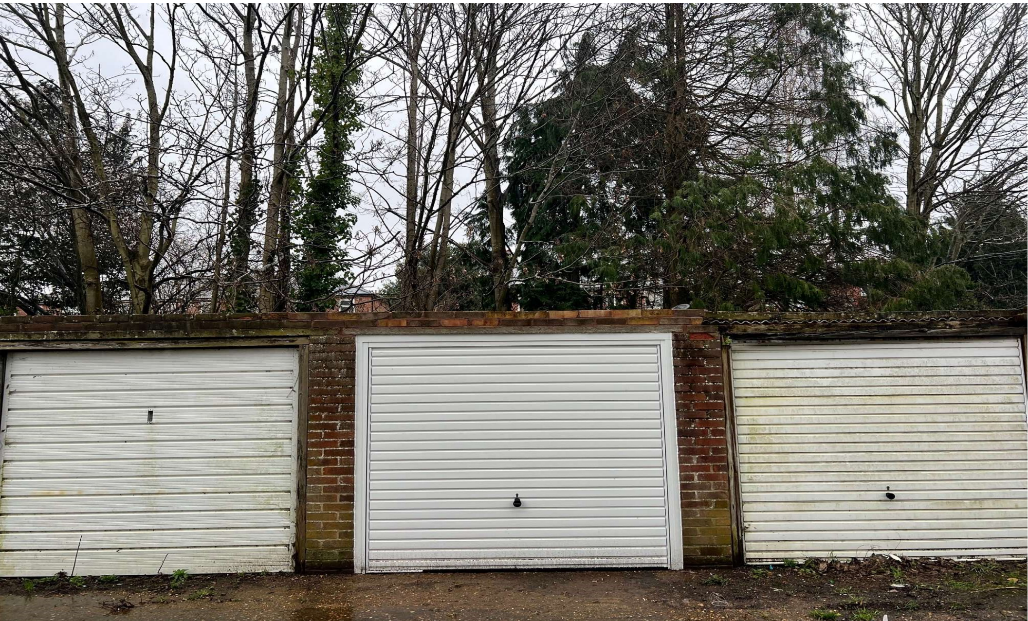
Brookland Close, Hastings TN34 2DF