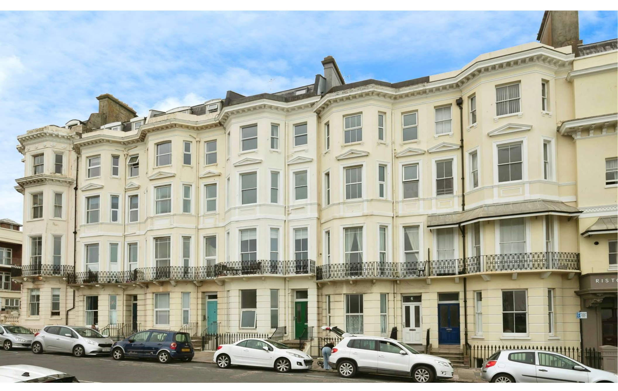
Basement Flat Warrior Square, St. Leonards-On-Sea TN37 6BX