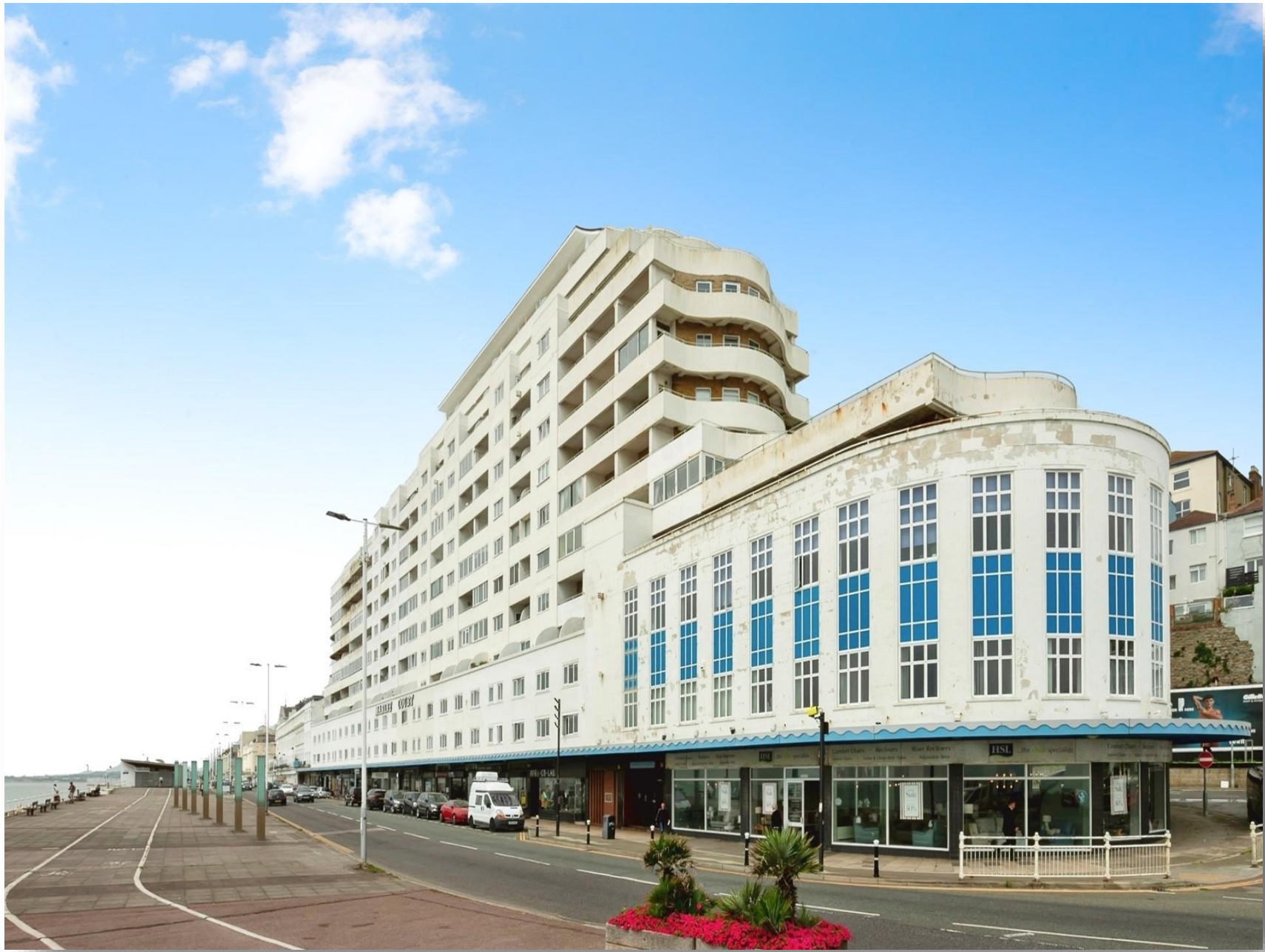
Marine Court, St. Leonards-On-Sea TN38 0DW