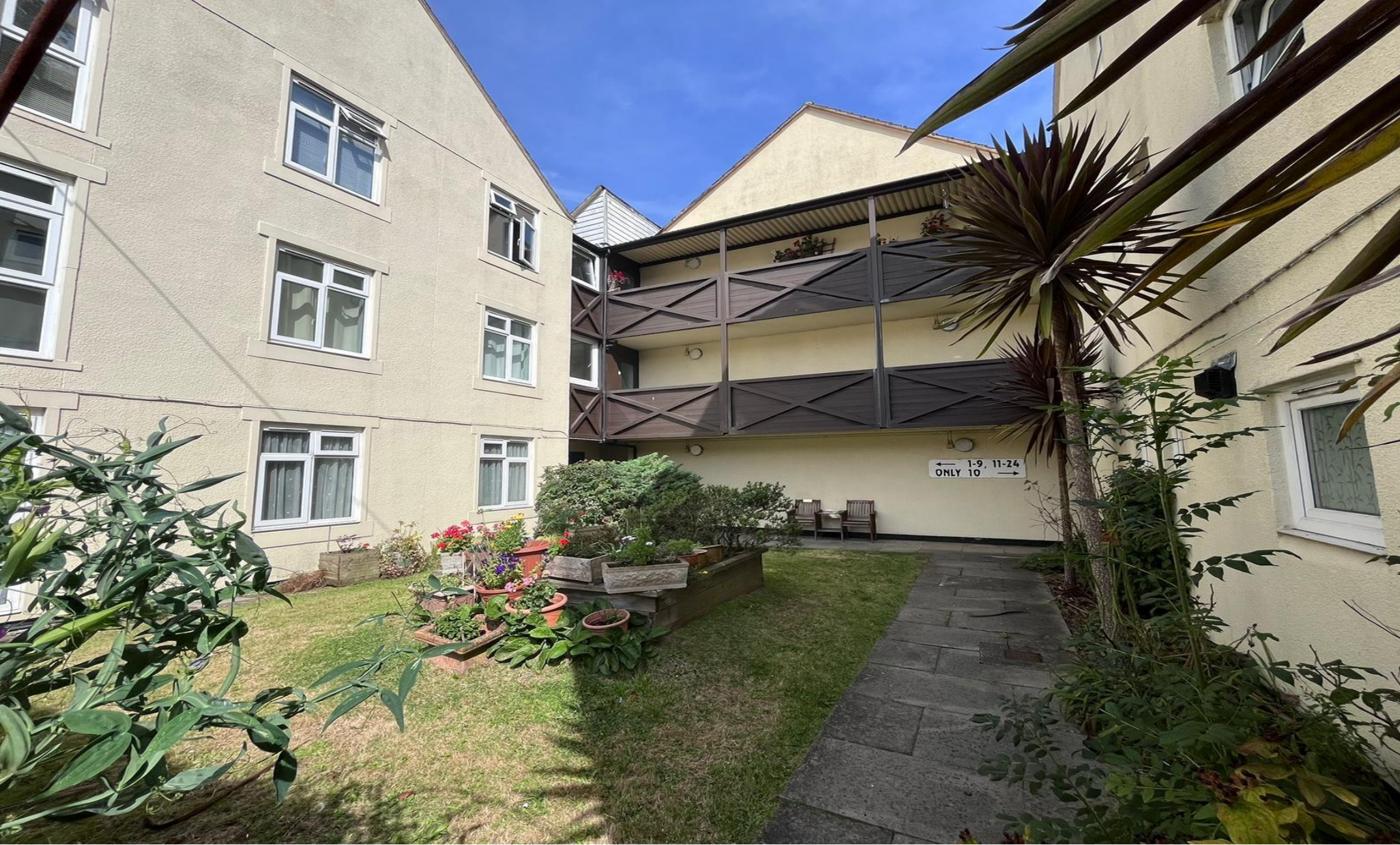
Helenhurst Court Ashford Road, Hastings TN34 2HX