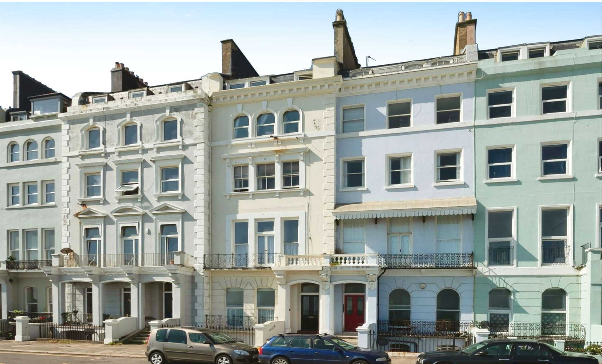
Marina, St. Leonards-On-Sea TN38 0BL