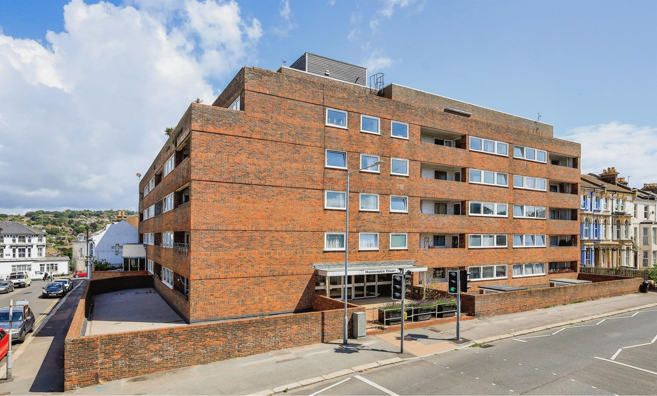
Hughenden Court Mount Pleasant Road, Hastings TN34 3ST