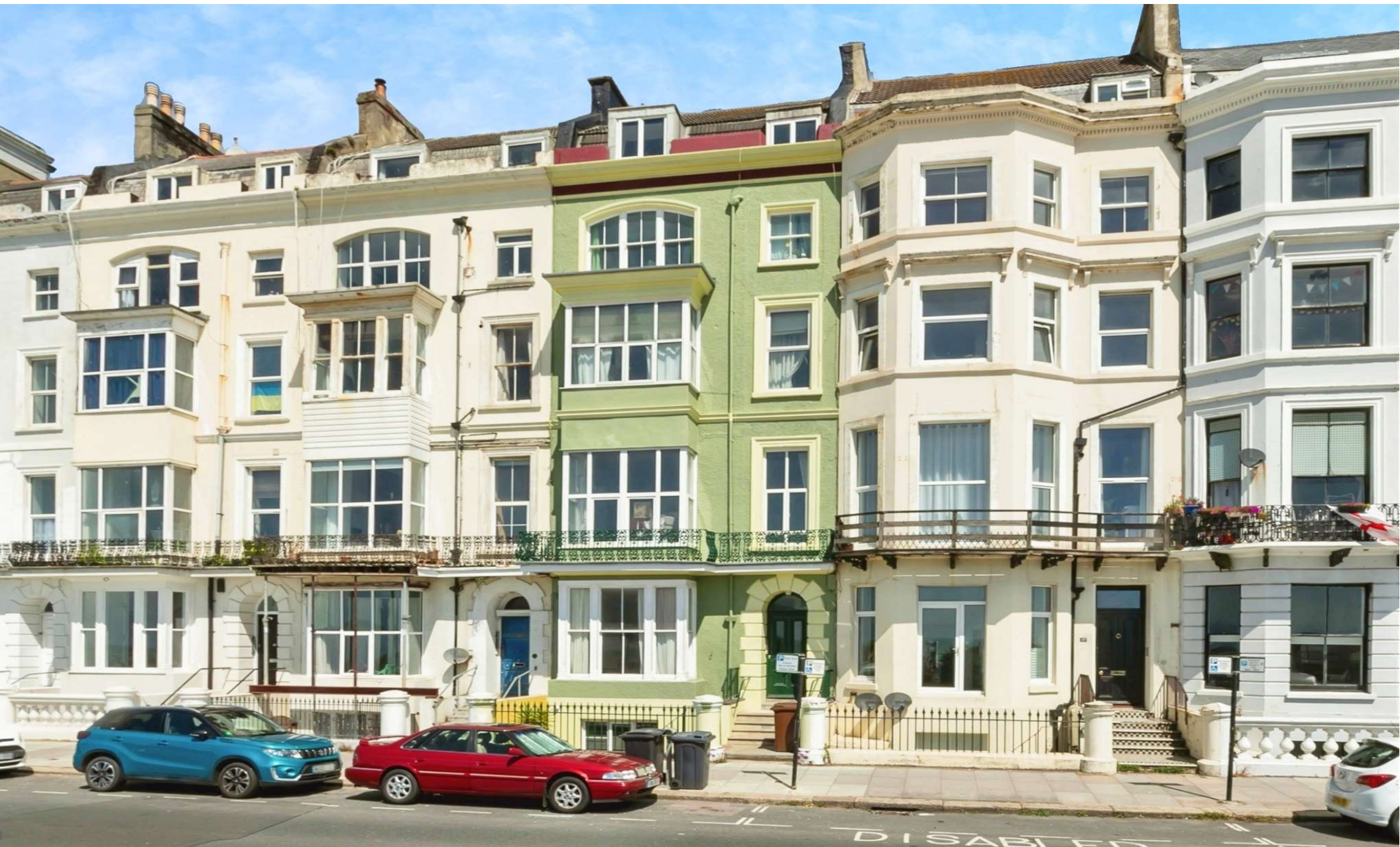
Eversfield Place, St. Leonards-On-Sea TN37 6BY