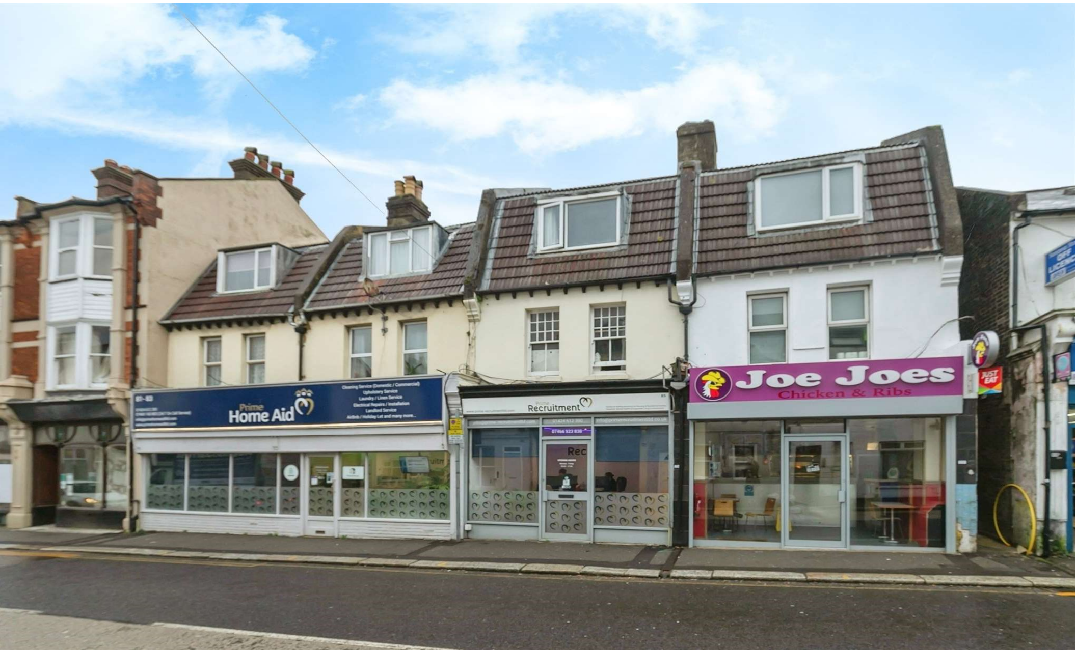
Bohemia Road, St. Leonards-On-Sea TN37 6RJ