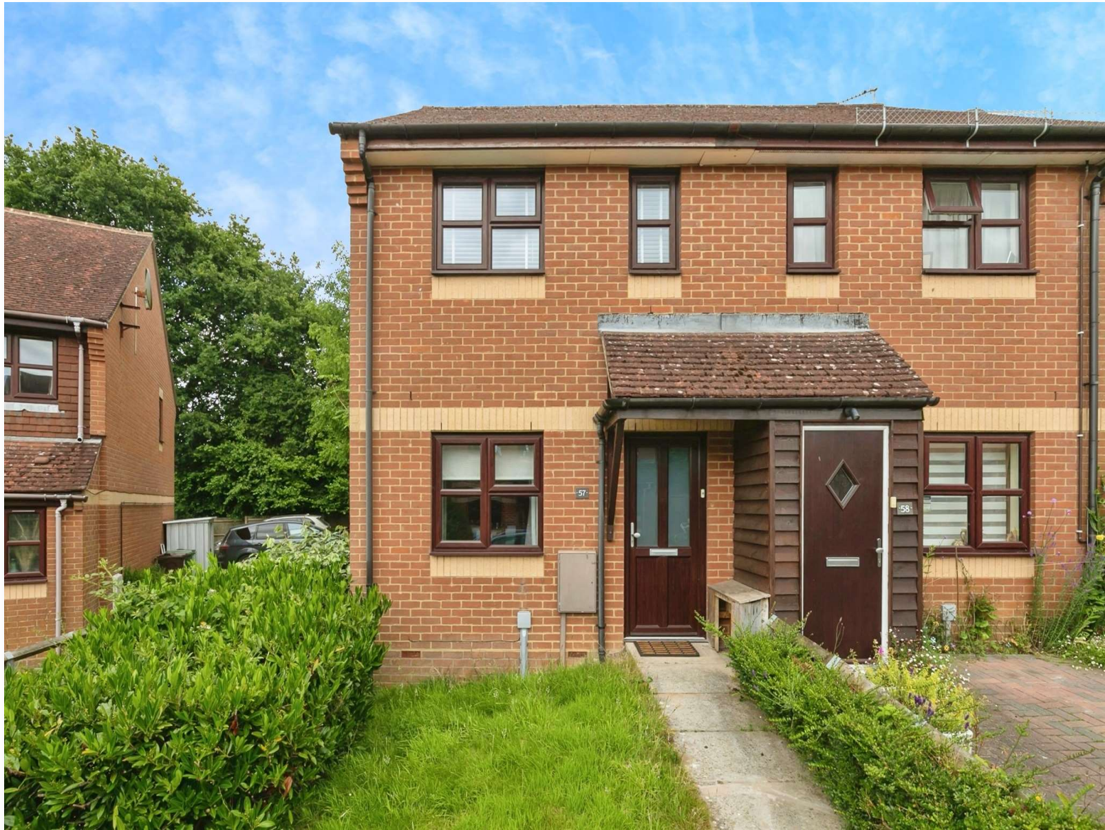
New Moorsite, Westfield HASTINGS TN35 4QP