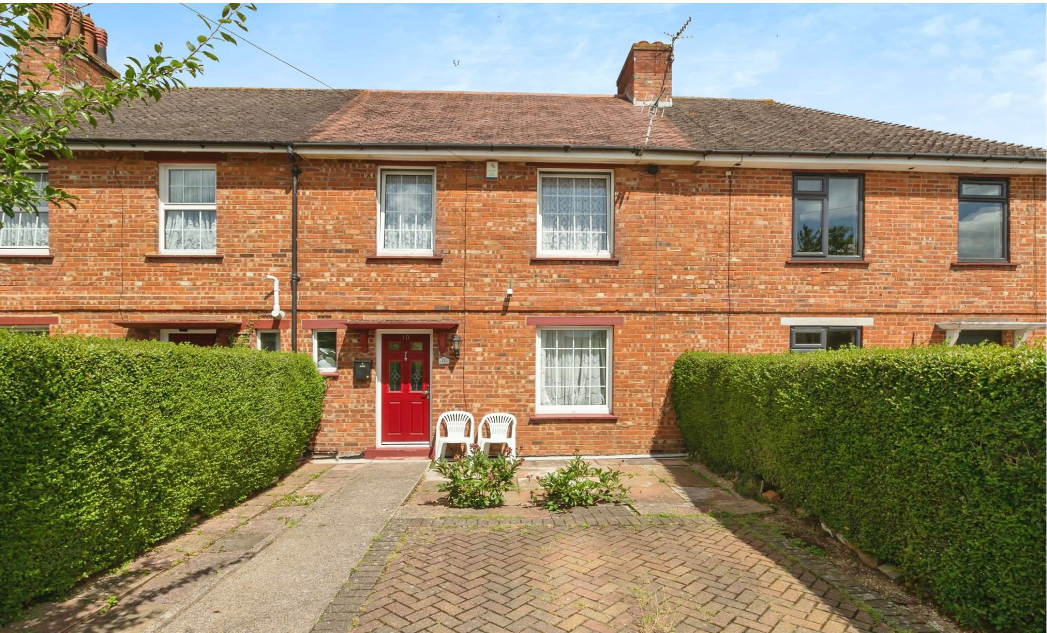
Eversley Crescent, St. Leonards-On-Sea TN37 6QF