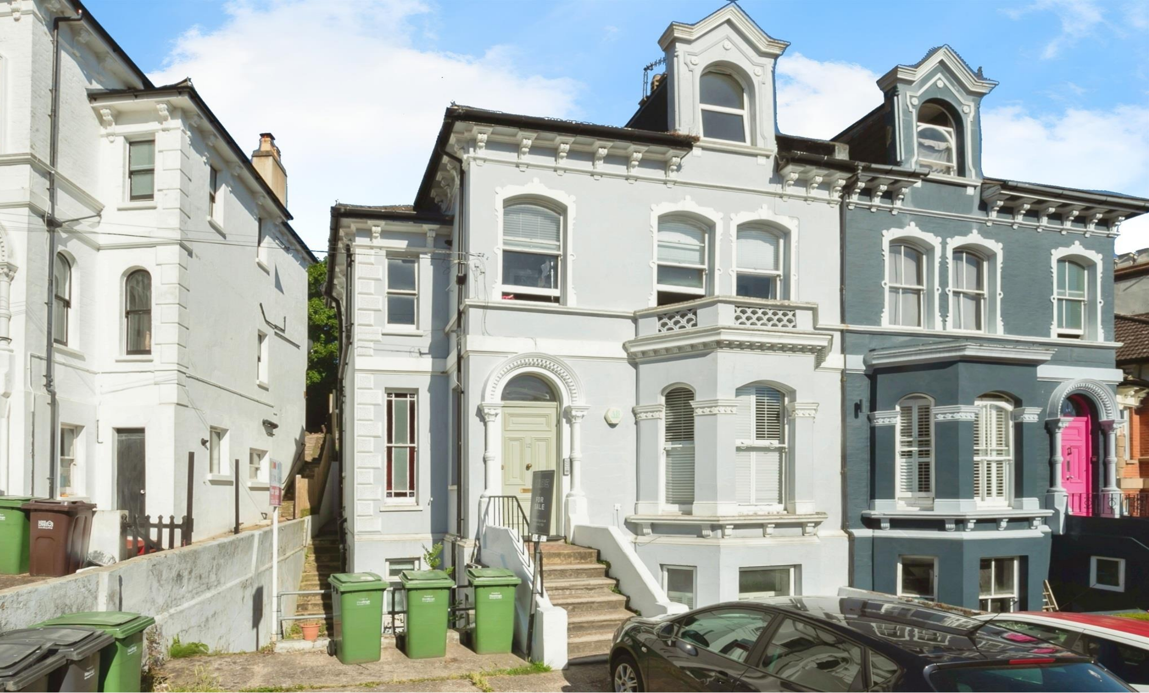
Flat 1 St. Helens Park Road, Hastings TN34 2ER