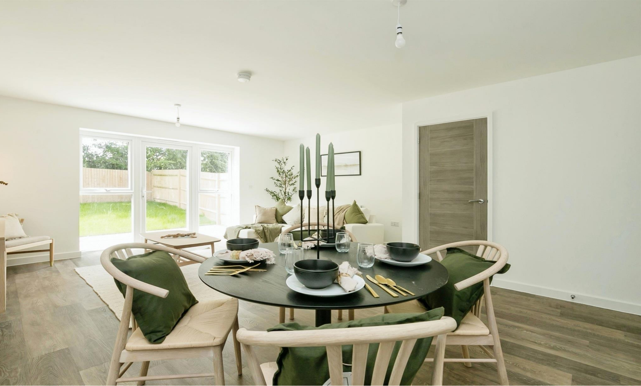
The Oak The Brook, Northiam Rye TN31 6QF