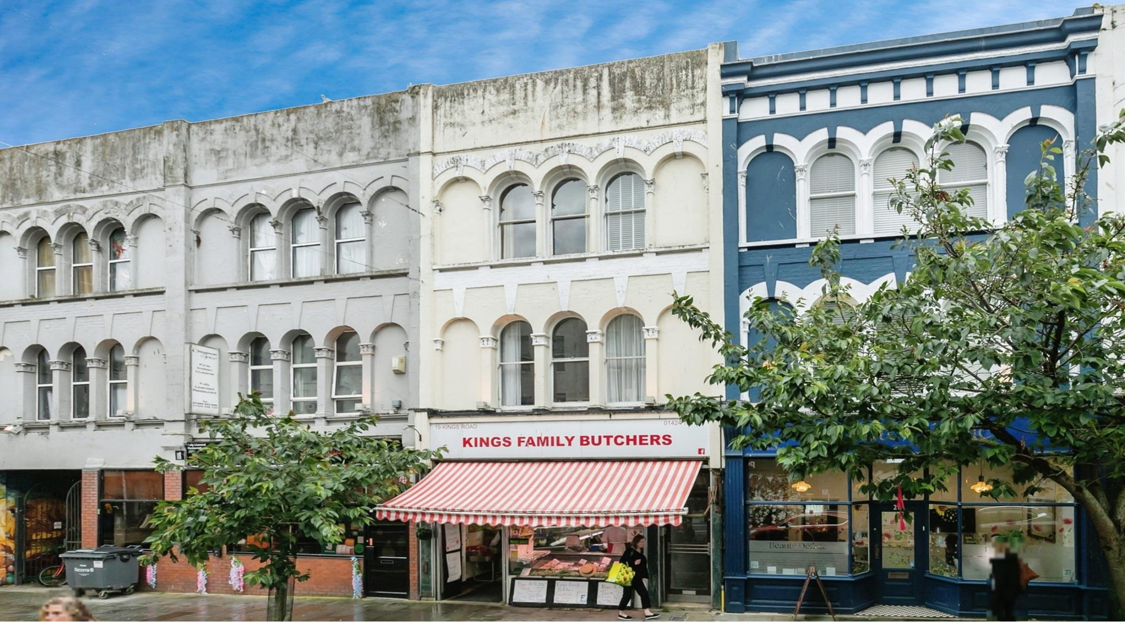
Kings Road, St. Leonards-On-Sea TN37 6DU