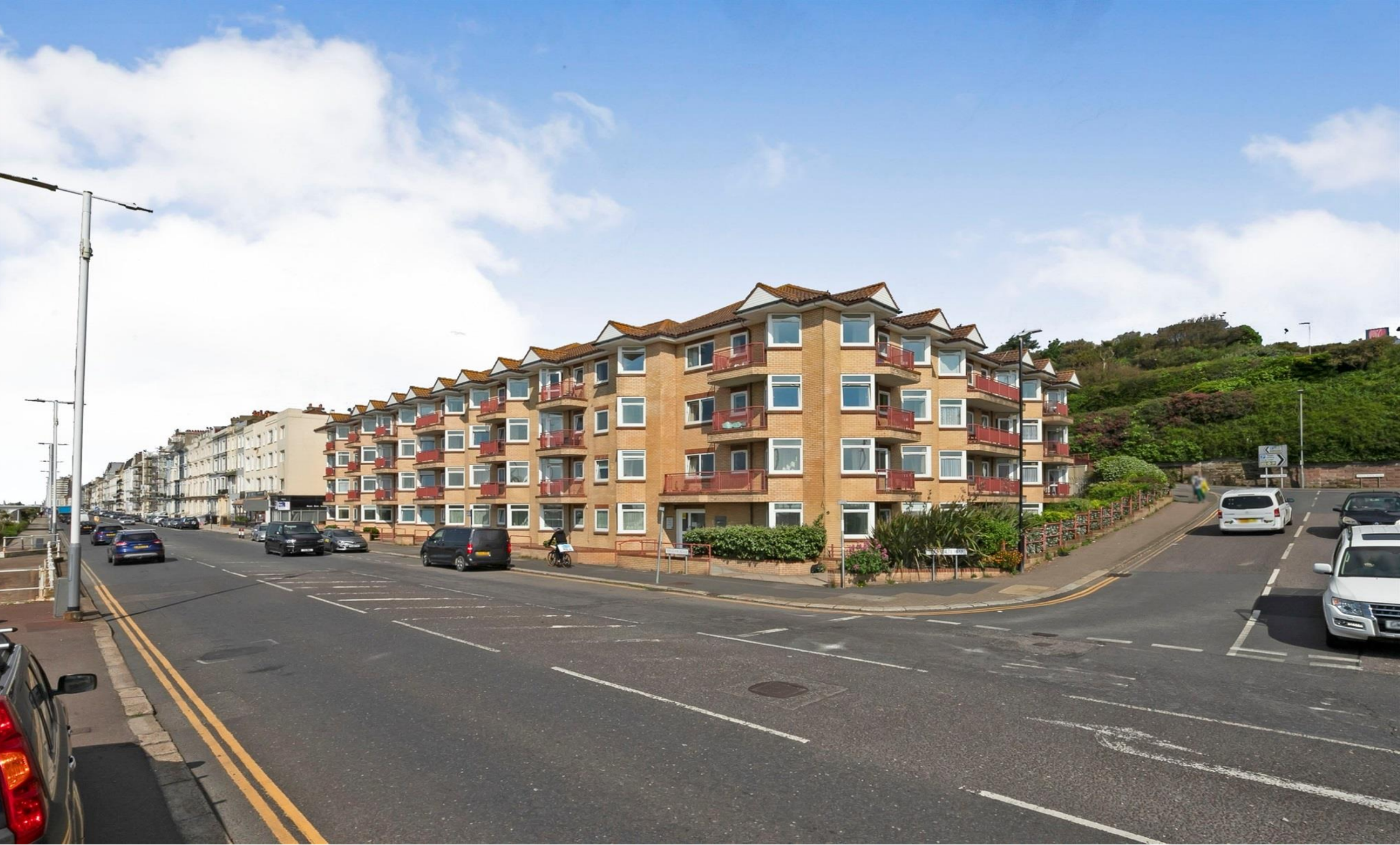
Waverley Court, St. Leonards-On-Sea TN37 6QR