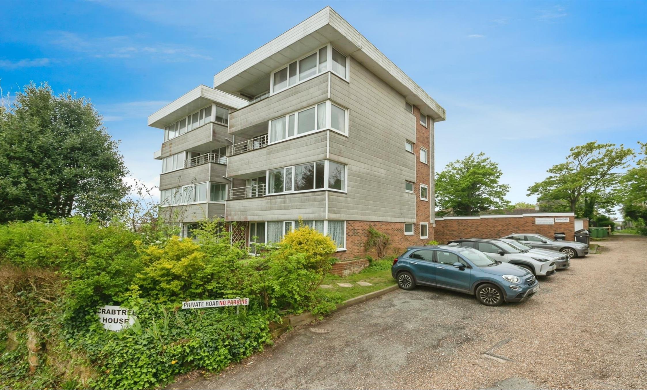
Crabtree House Archery Road, St. Leonards-On-Sea TN38 0YN