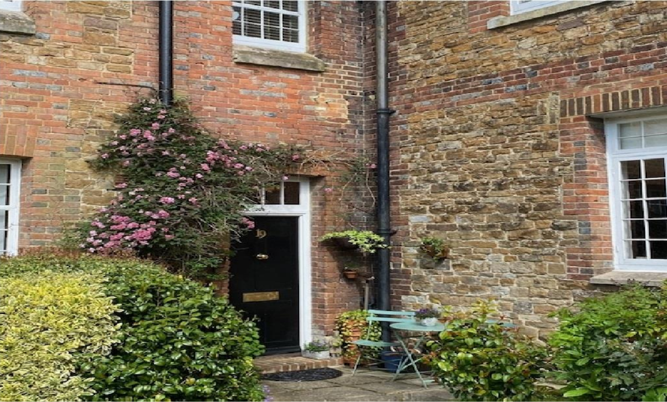
Frederick Thatcher Place, Battle TN33 0HW