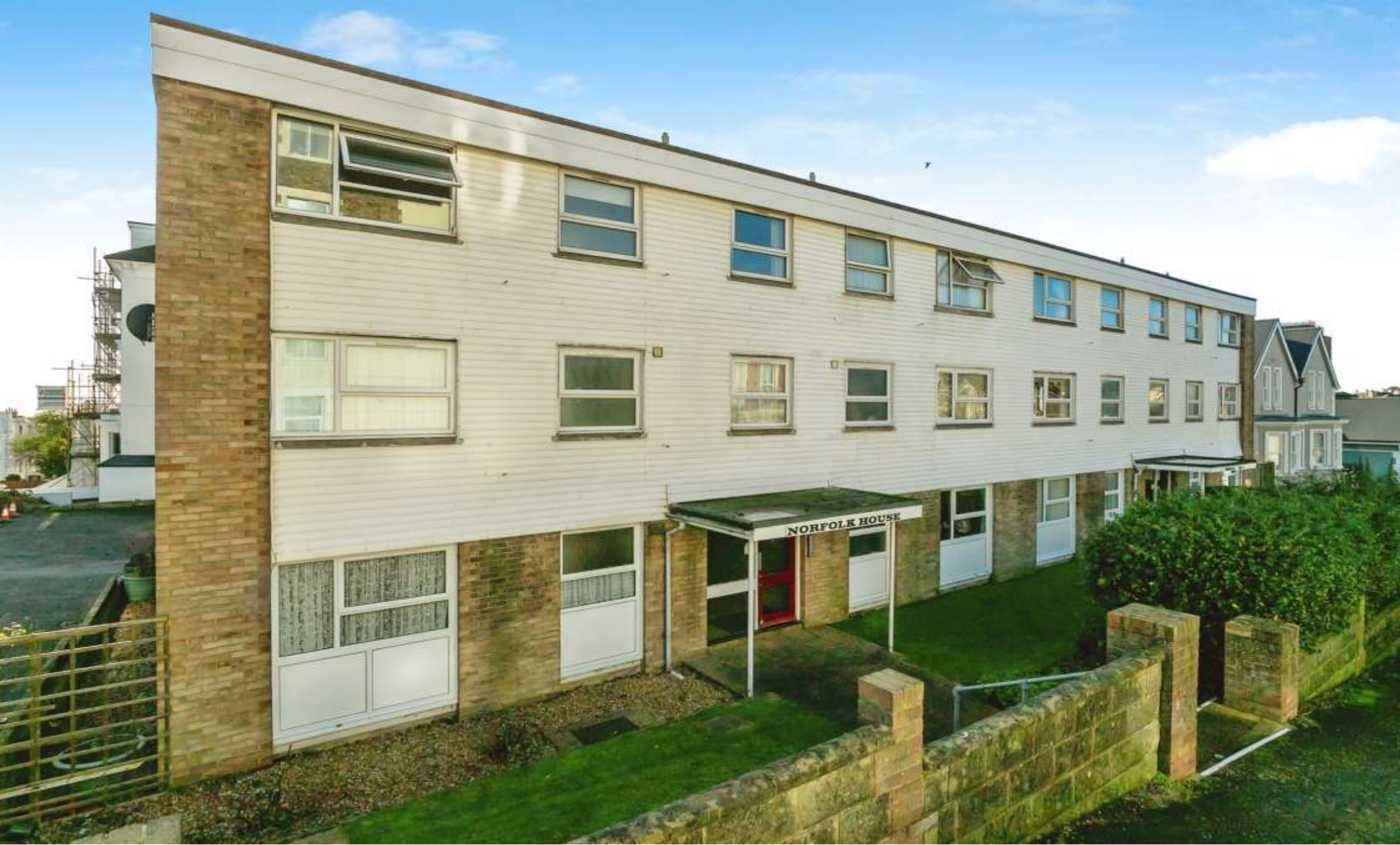
Norfolk House Ellenslea Road, St. Leonards-On-Sea TN37 6HZ