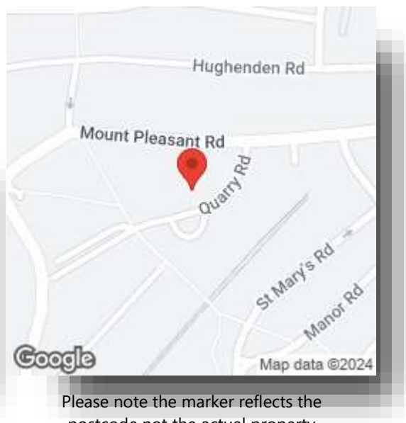
postcode not the actual property