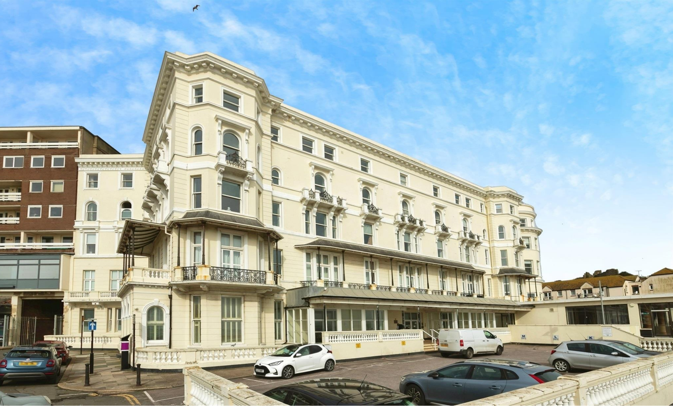
The Queens Apartments Robertson Terrace, Hastings TN34 1JN