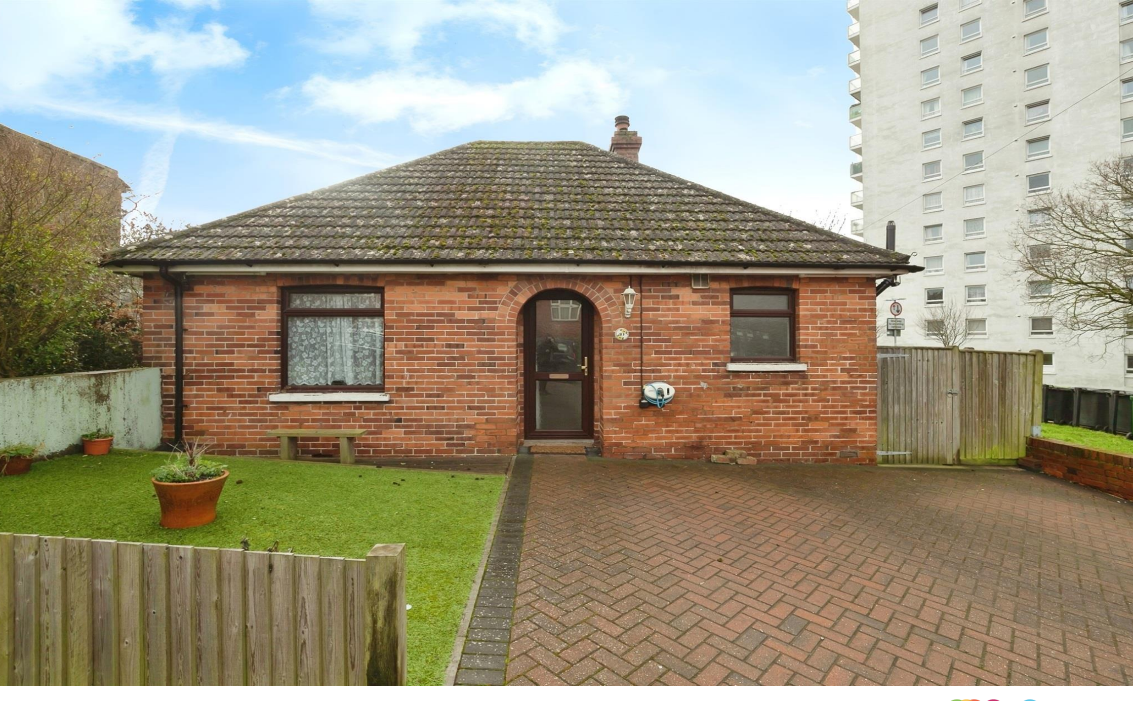
Adelaide Road, St. Leonards-On-Sea TN38 9DA